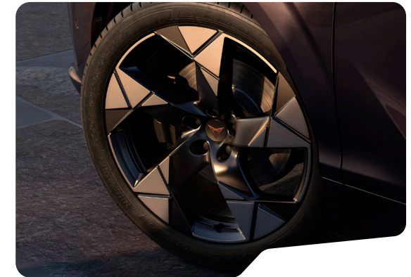
GRAVITY** (Z0B) 20" MACHINED SPORT BLACK MATT/ SILVER T VZ