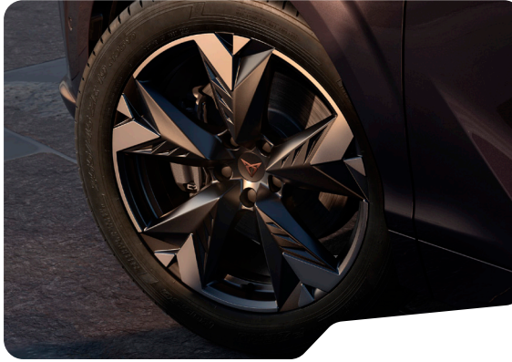
SPECTRUM (Z9R) 19" MACHINED SPORT BLACK MATT / SILVER T VZ