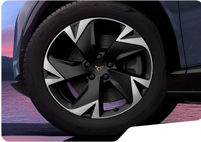
VULCANO 19IN MACHINED WHEELS