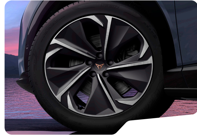
HECKLA 20IN MACHINED WHEELS