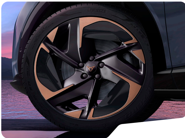
KATLA 21IN MACHINED WHEELS