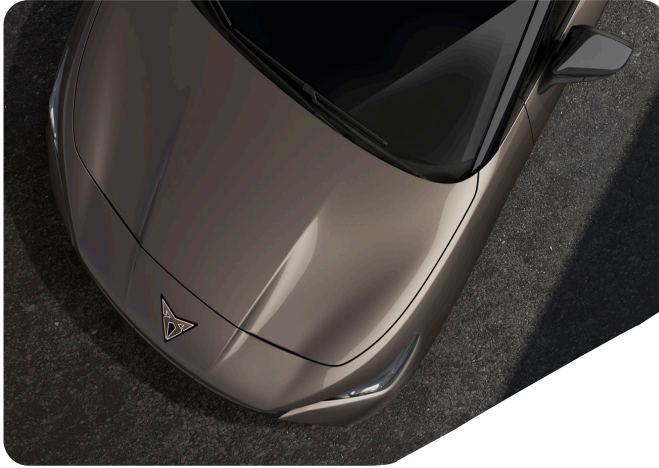
ATACAMA DESSERT - 1B1B (Soft) EN VZ