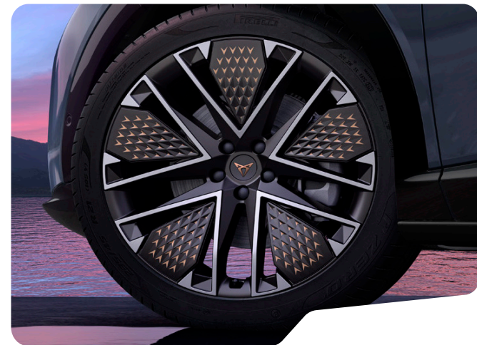
ETNA 21IN MACHINED WHEELS