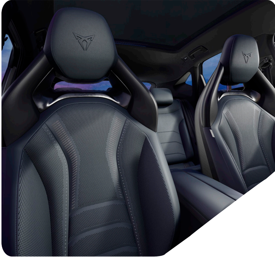
HERO CUP BUCKET SEATS - LG Endurance 7 VZ10