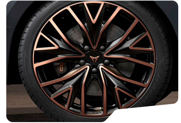
MISTRAL COPPER 19IN MACHINED SPORT BLACK / COPPER L VZ