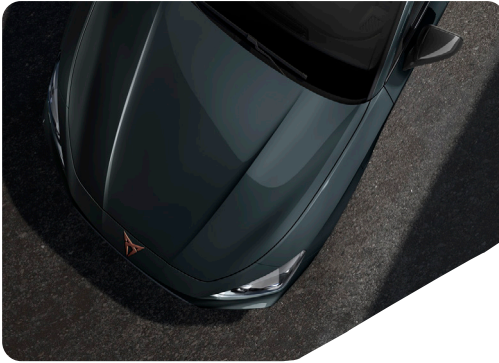
MIDNIGHT BLACK- OE0E (Metallic) L VZ