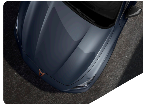
MAGNETIC TECH - S7S7 (Metallic) F vz