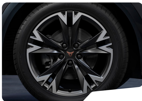
SONORA 18IN MACHINED SPORT BLACK / SILVER F