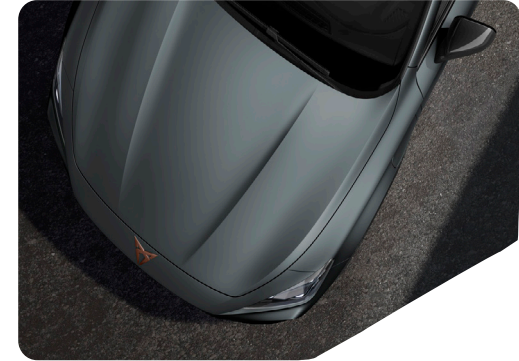
ENCELADUS GREY- Q7Q7 (Matt) vz