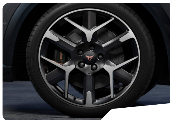
HAILSTORM (Z9I) 19IN FORGED MACHINED SPORT BLACK / SILVER VZ