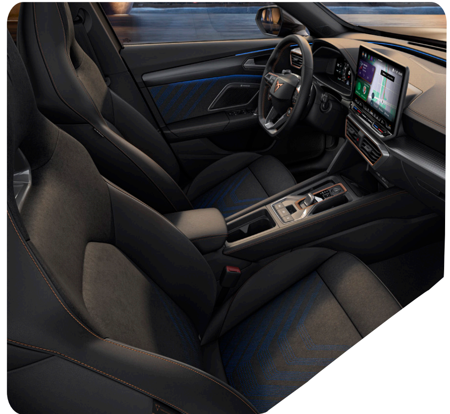
DYNAMIC AMBIENT* - CG & PS2 F VZ