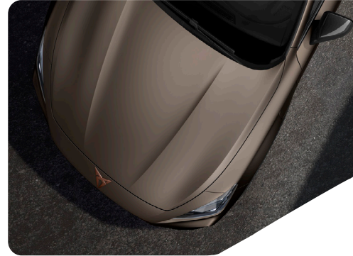
CENTURY BRONZE- L3L3 (Matt) vz