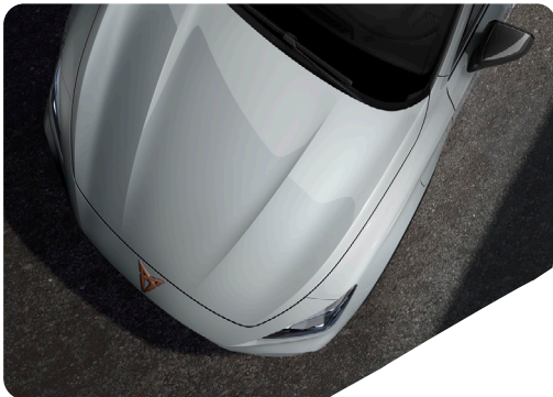
GLACIAL WHITE- 2Y2Y (Metallic) F vz