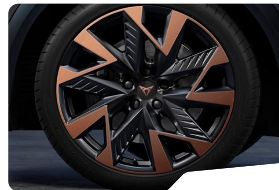
SANDSTORM COPPER (Z9E) 19IN MACHINED SPORT BLACK / COPPER F VZ