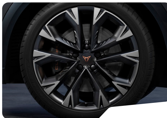
ARTIC (Z9C) 19IN MACHINED SPORT BLACK / SILVER F VZ