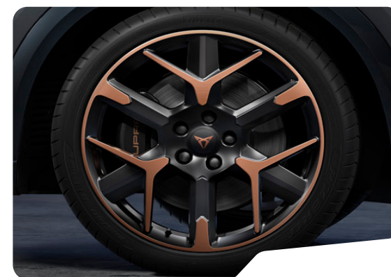
HAILSTORM COPPER (Z9M) 19IN FORGED MACHINED SPORT BLACK / COPPER VZ