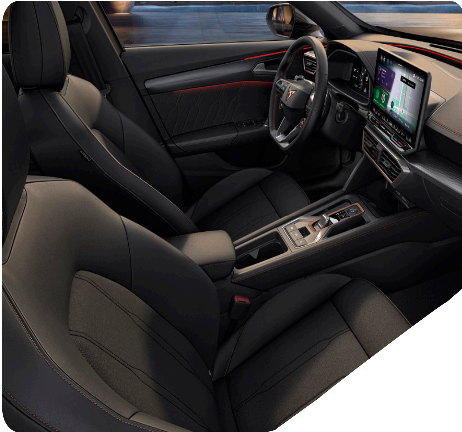
SHARP AMBIENT - AQ F