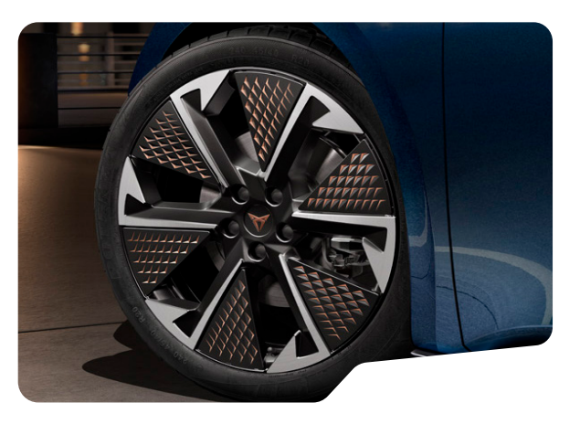
THUNDERSTORM 20 IN AERO BLACK / COPPER