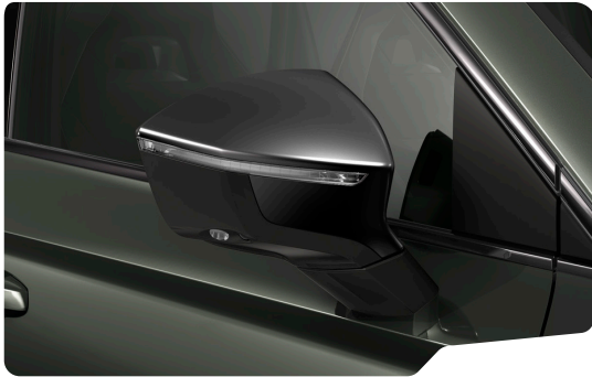
↓ DARK FOREST - 3C3C (Special Metallic)