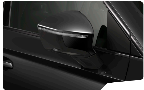
↓ MAGIC BLACK - 1Z1Z (Metallic)