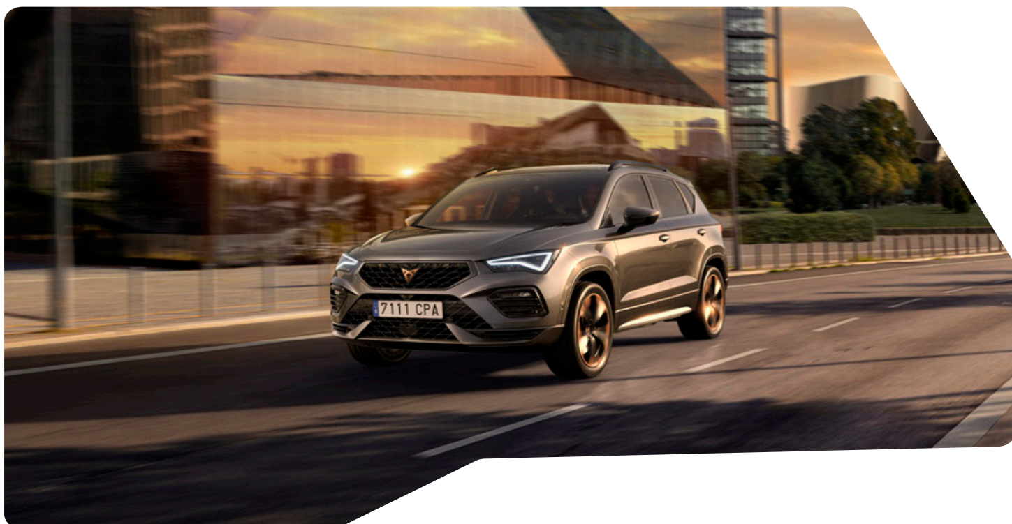
CUPRA ATECA- IMPULSE Standard Equipment

Images are shown for representative purposes only and may contain optional extras.