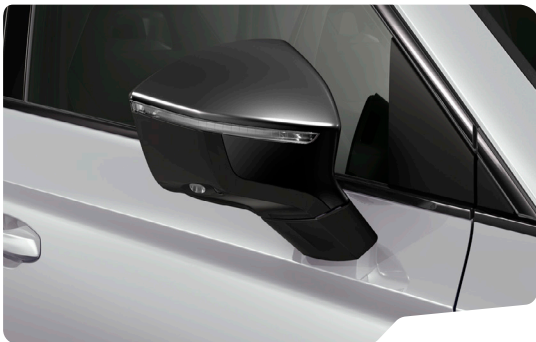
↓ NEVADA WHITE - 2Y2Y (Metallic)