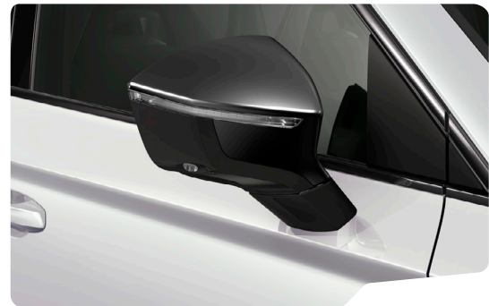
↓ BILA WHITE - 9P9P (Soft)