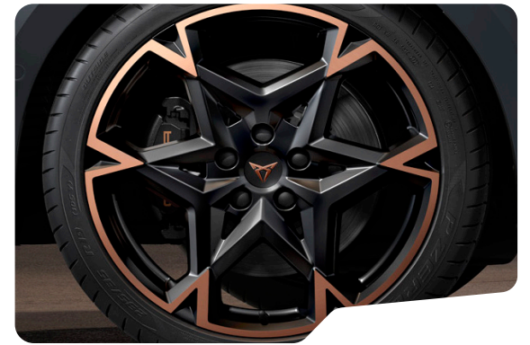
POLAR COPPER (R9E/PD2) 19IN MACHINED SPORT BLACK / COPPER L VZ