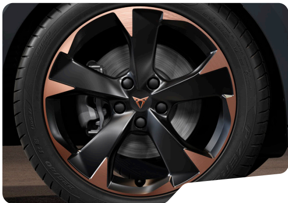
GARBI COPPER (R8E) 18IN MACHINED COPPER L