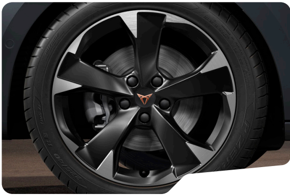
GARBI 18IN MACHINED SPORT BLACK / SILVER KU*BNX Only