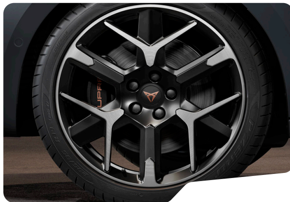
HAILSTORM (R9I) 19IN FORGED MACHINED SPORT BLACK / SILVER VZ