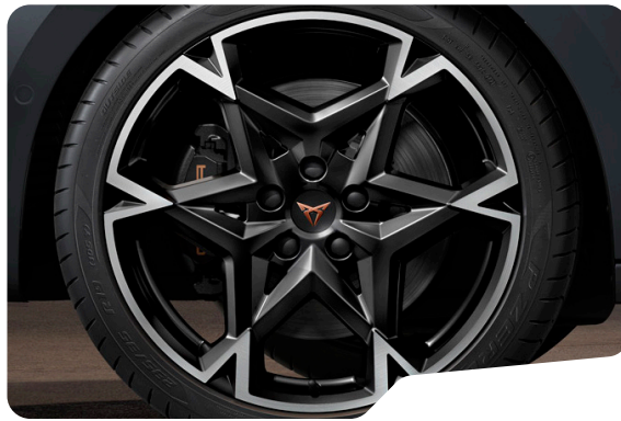
POLAR (R8E/PD1) 19IN MACHINED SPORT BLACK / SILVER L VZ