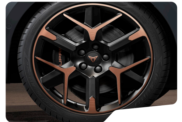
HAILSTORM COPPER (R9M) 19IN FORGED MACHINED SPORT BLACK / COPPER VZ