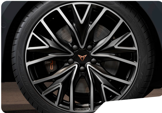
MISTRAL (R9C/PD3) 19IN MACHINED SPORT BLACK / SILVER L VZ