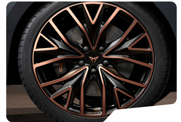
MISTRAL COPPER (R9G/PD4) 19IN MACHINED SPORT BLACK / COPPER L VZ