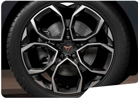
WINDSTORM 18IN MACHINED SPORT BLACK / L