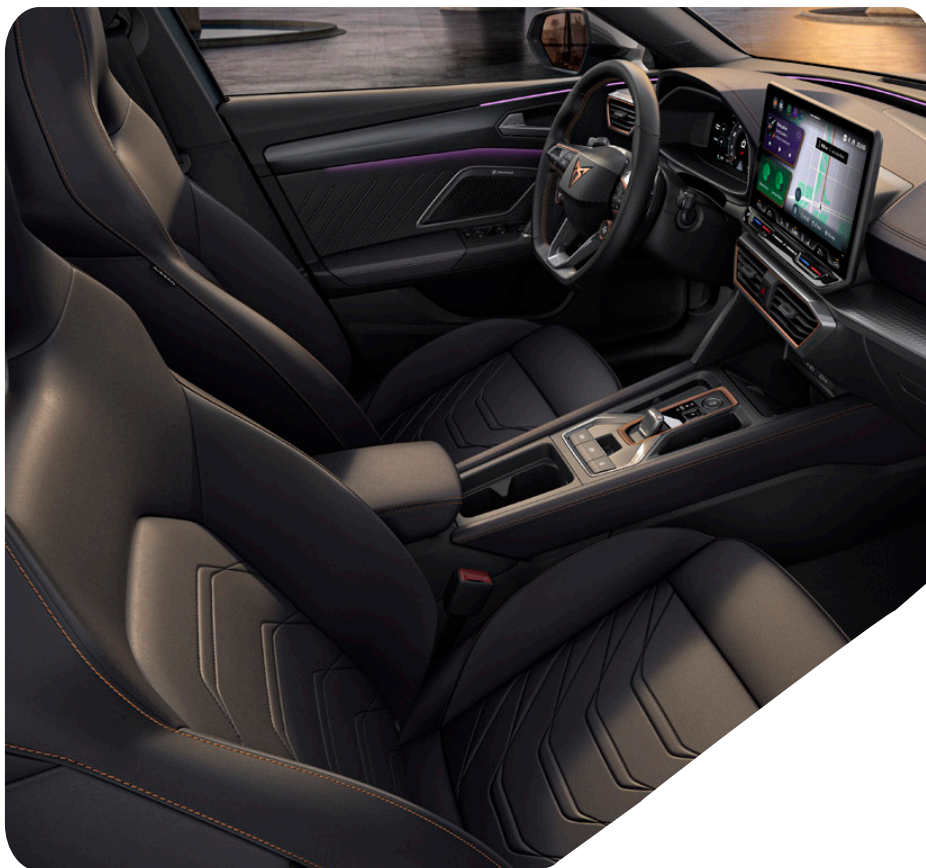
PROGRESSIVE AMBIENT - KE L vz