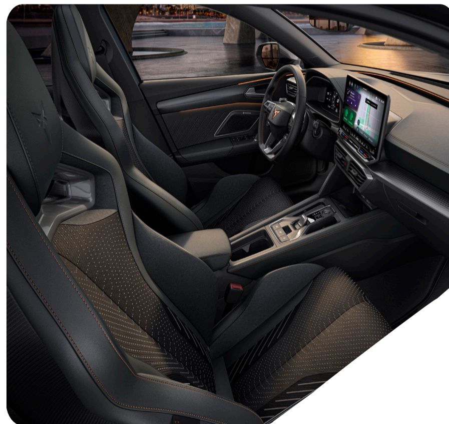
EXTREME AMBIENT - LN vz (Coming soon)