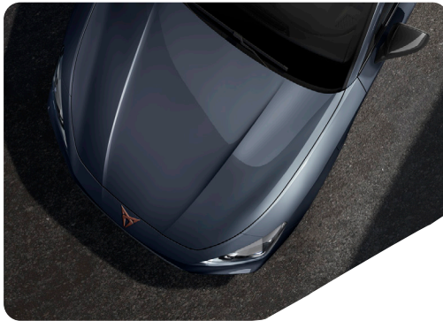
MAGNETIC TECH - S7S7 (Metallic) L VZ