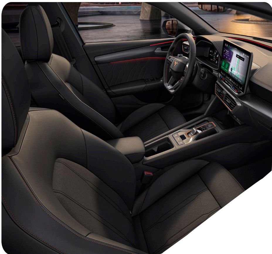
SHARP AMBIENT - AQ L