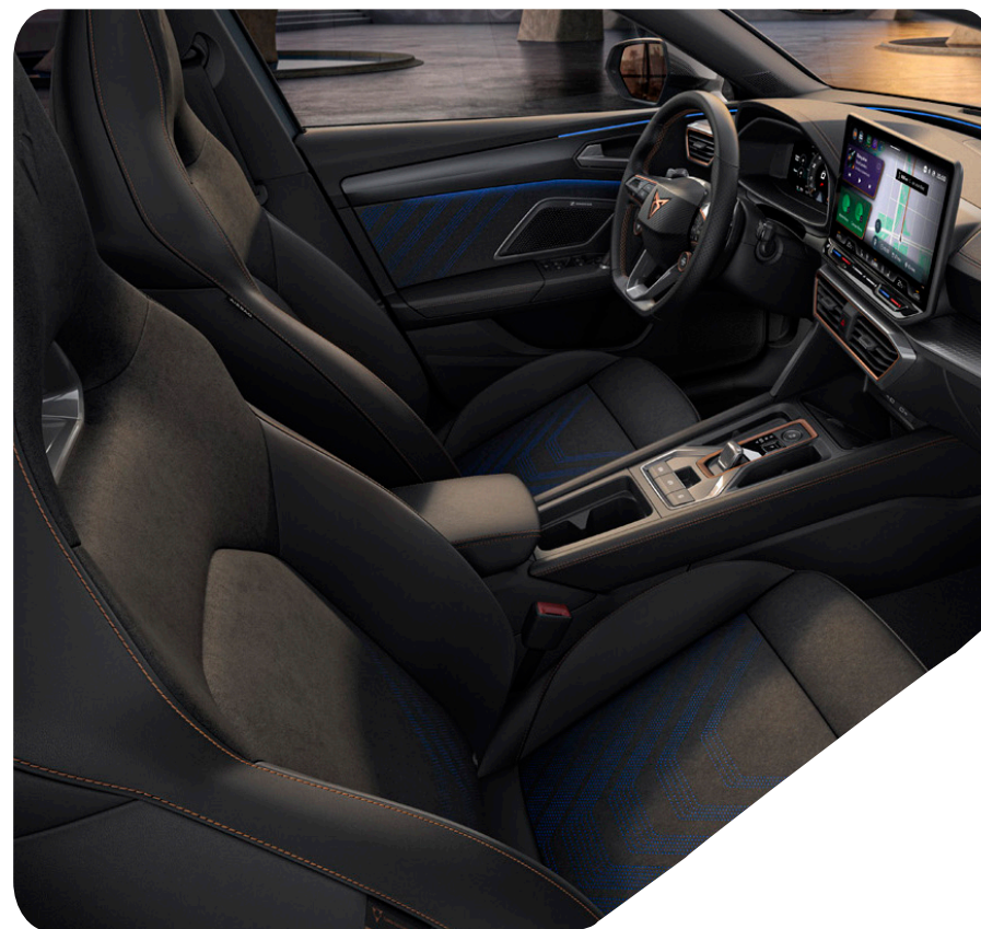
DYNAMIC AMBIENT - CG L VZ