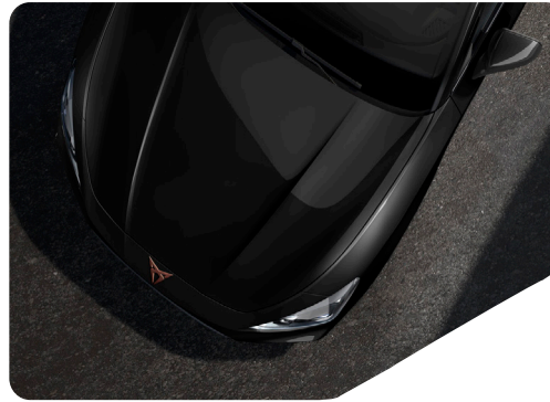
MIDNIGHT BLACK- OE0E (Metallic) L VZ