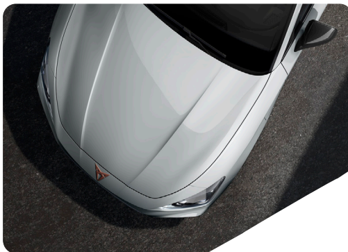
GLACIAL WHITE- 2Y2Y (Metallic) L VZ