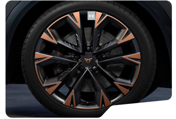
ARTIC COPPER (Z9G) 19IN MACHINED SPORT BLACK / COPPER F VZ