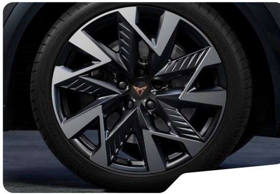
SANDSTORM (Z9A) 19IN MACHINED SPORT BLACK / SILVER F VZ