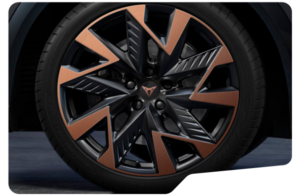
SANDSTORM COPPER (Z9E) 19IN MACHINED SPORT BLACK / COPPER F VZ