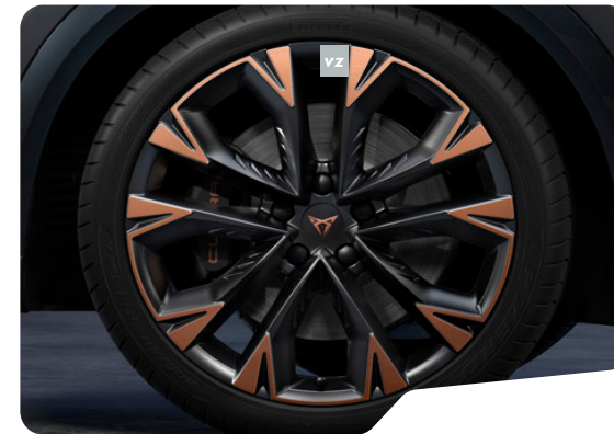
ARTIC COPPER 19IN MACHINED SPORT BLACK / COPPER F