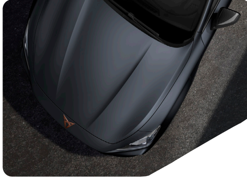
MAGNETIC TECH MATT - 9R9R (Matt) F vz