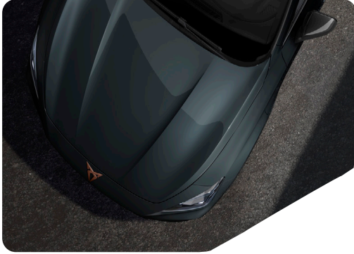
FIORD BLUE - 9K9K (Soft) F vz