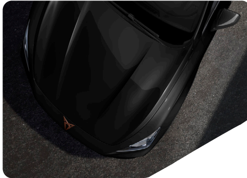
MIDNIGHT BLACK- OE0E (Metallic) F vz