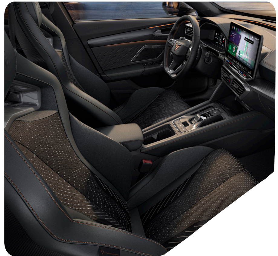
EXTREME AMBIENT - LN VZ (Coming soon)