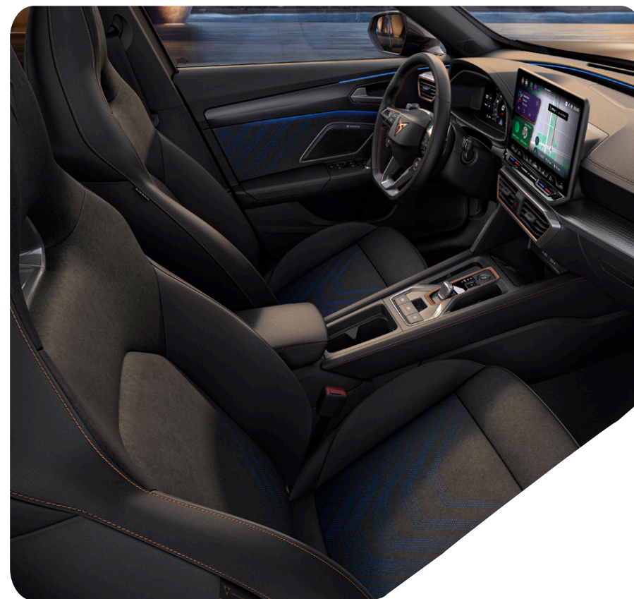
DYNAMIC AMBIENT - CG F VZ