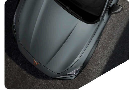
ENCELADUS GREY- Q7Q7 (Matt) vz